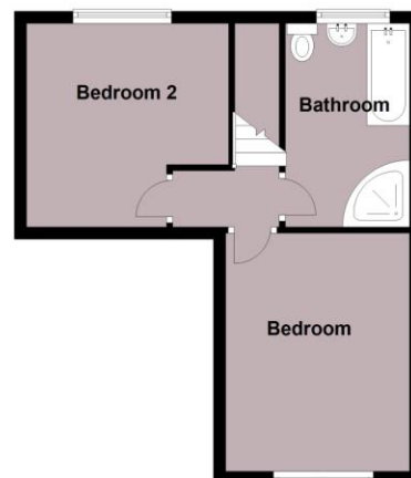
First Floor Approx. 33.1 sq. metres (356.5 sq. feet)

For illustration purposes only. Plan produced using PlanUp.