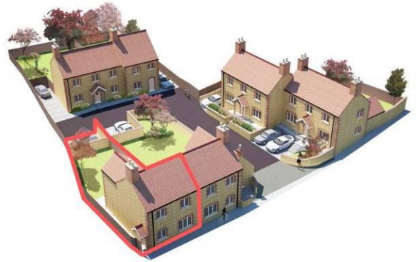
THE OLDE BARN TEALY ARTIST'S IMPRESSION: AERIAL VIEW

Regulated by RICS. Mundys is the trading name of Mundys Property Services LLP registered in England NO. OC353705. The Partners are not Partners for the purposes of the Partnership Act 1890. Registered Office 29 Silver Street, Lincoln, LN2 1AS.