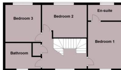
Total area: approx. 133.9 sq. metres (1441.0 sq. feet) For illustration purposes only Plan produced using PlanUp