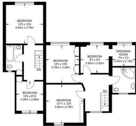
FIRST FLOOR 1040 SQ FT / 96.6 SQ M

APPROXIMATE GROSS INTERNAL AREA 2496 SQ FT / 231.9 SQ M OUTBUILDINGS = 492 SQ FT / 45.7 SQ M TOTAL = 2988 SQ FT / 277.6 SQ M