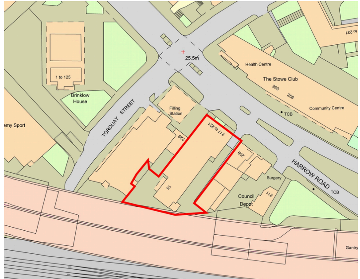
Indicative site boundary, not to scale

A resolution to grant planning permission (Ref: 21/06475/FULL) was passed at Committee in September 2022, subject to concurrence of the Mayor of London and completion of a S106 agreement. The application was withdrawn in November 2023.