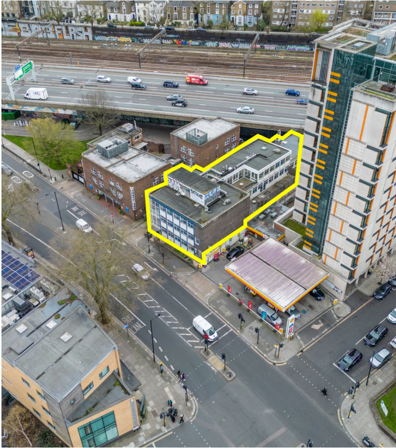
Site Boundary for Indicative Purposes Only