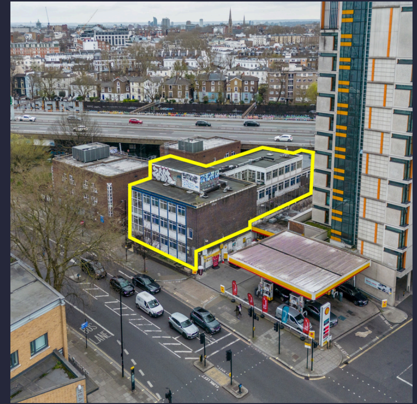
Site Boundary for Indicative Purposes Only