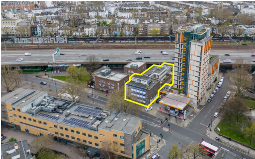
Site Boundary for Indicative Purposes Only

The existing building was built in the 1960's and was originally designed for use as office space. St. Mungo's converted the building into a facility for providing temporary accommodation and support for rough sleepers in the early 1990's and it is still currently in occupation under that use.