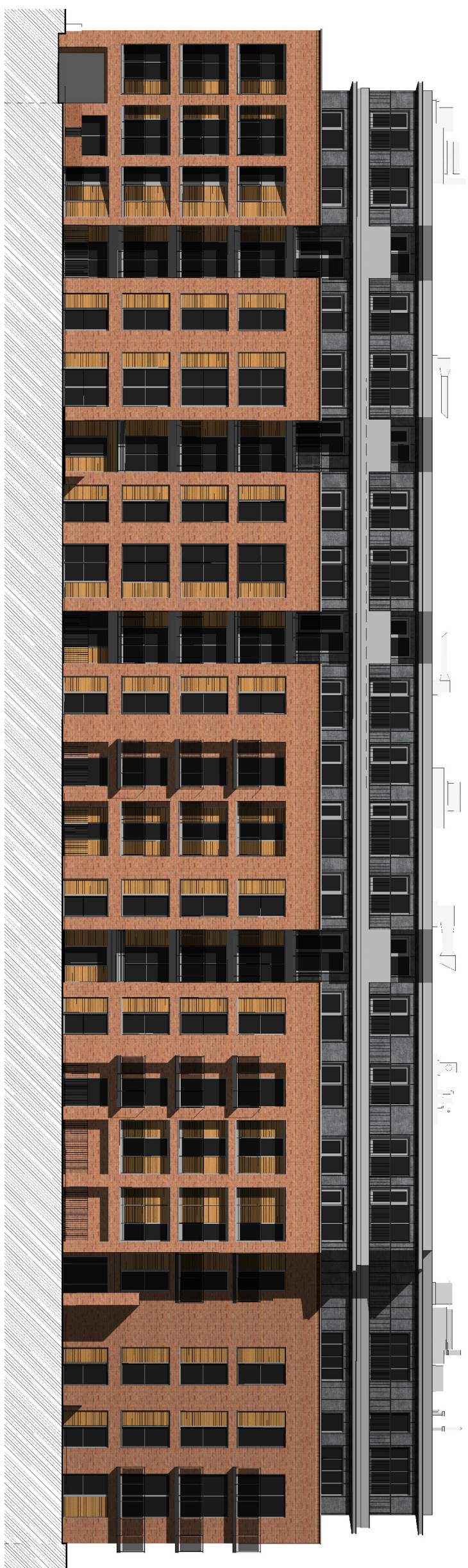
Proposed Front Elevation 1:250 @ A3