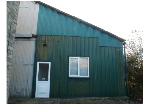
Rear External Elevation