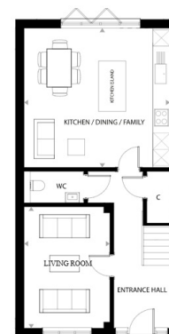
GROUND FLOOR FIRST FLOOR