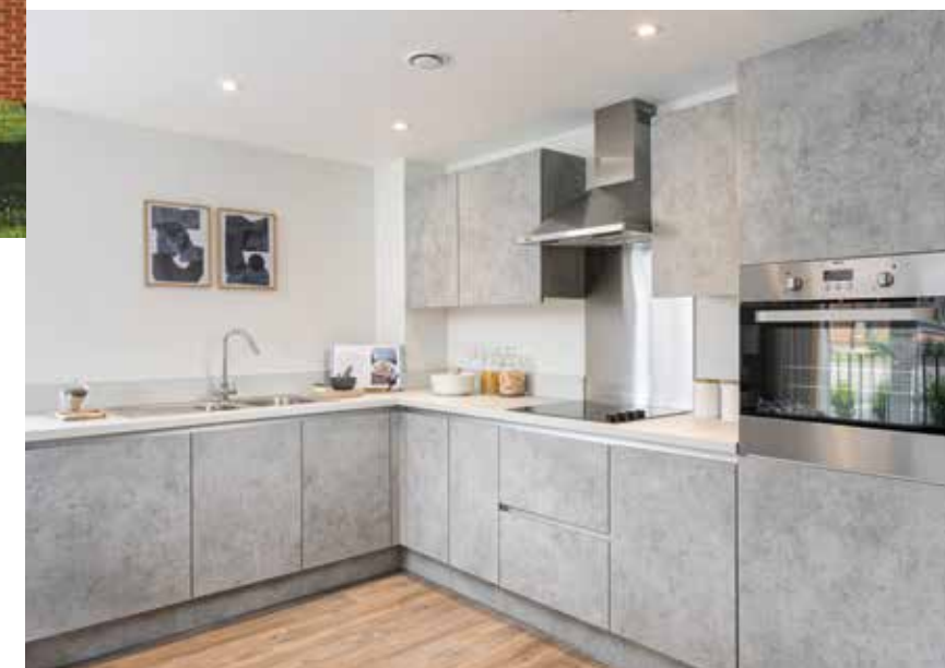
Carina apartments, Alphium.

Apartments at Woodgate from Alphium are perfectly attuned to the increasing desire by many people to recalibrate their priorities and live close to nature and enjoy a sense of space.