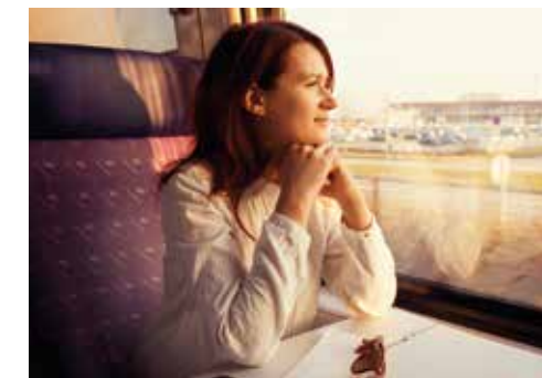
Capital connections Three Bridges station, with over 300 parking spaces, has fast and frequent services to London stations in the west end and City.