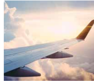
Global gateway Whether you're heading off for a beach holiday on the Florida coast or a European city break, London Gatwick is just eight miles away.

From commuting to soaking up the culture of the capital, at Woodgate you can enjoy an exceptional lifestyle without compromising on connectivity. And when it comes to long summer days down at the coast, watching the sun set on Brighton beach, then lingering late to enjoy the nightlife, that is just as easy to organize too.