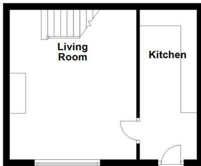
Ground Floor Approx. 27.1 sq. metres (291.6 sq. feet)