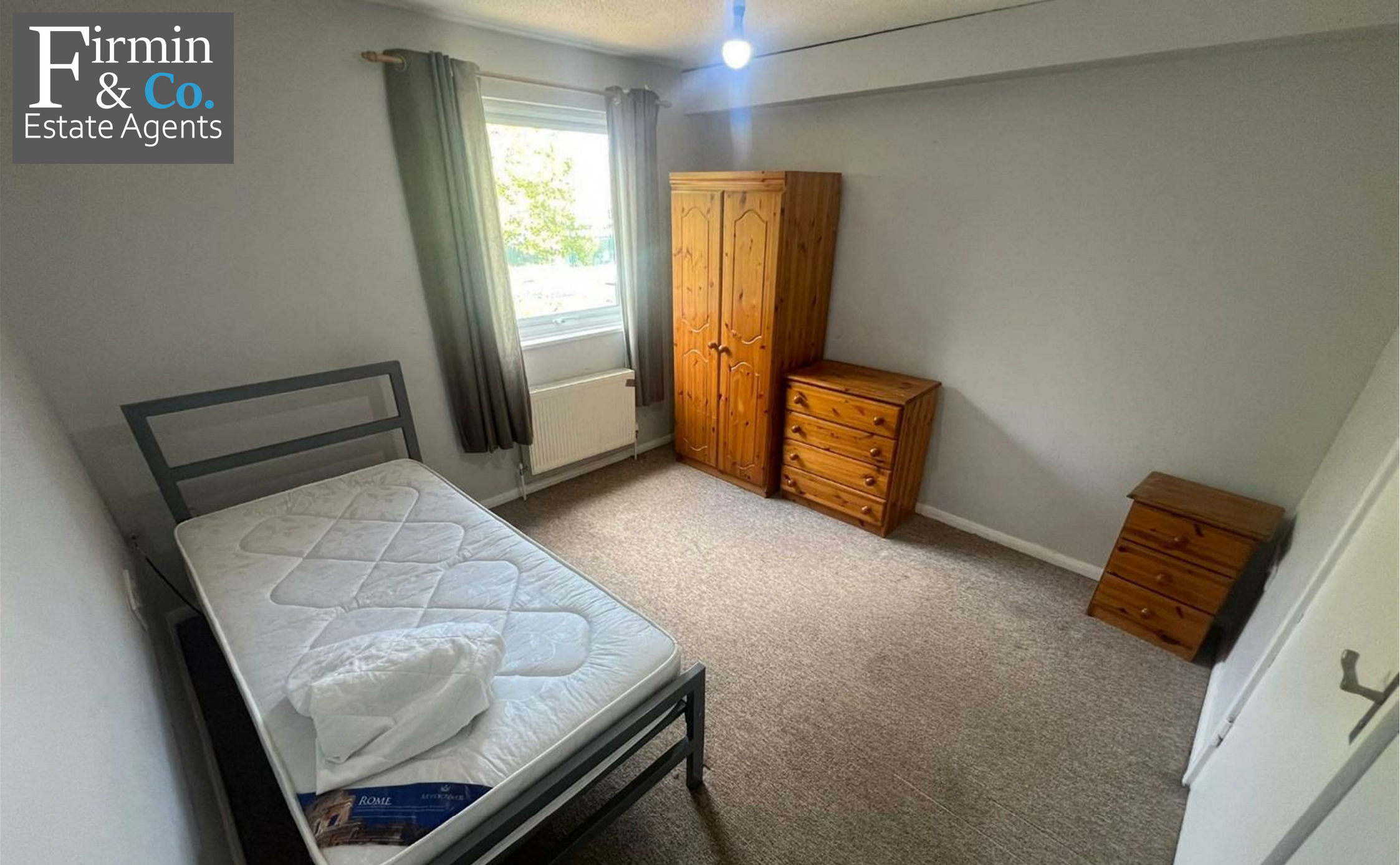
Room 2 Hinchcliffe PE2 5SS £575