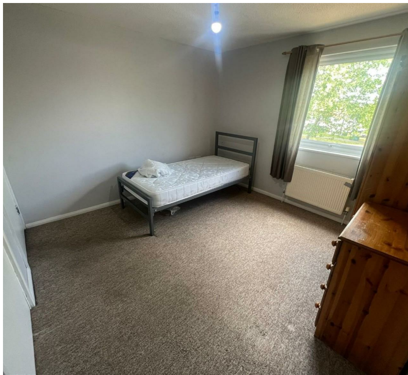
Room 2 Hinchcliffe PE2 5SS