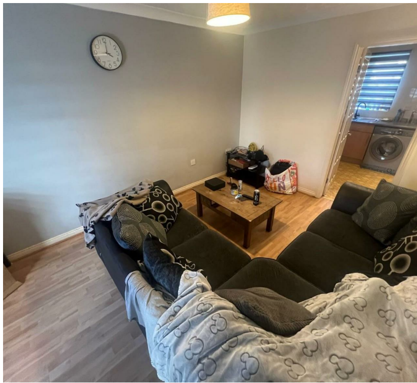
3 Woodpecker Court PE4 7FJ