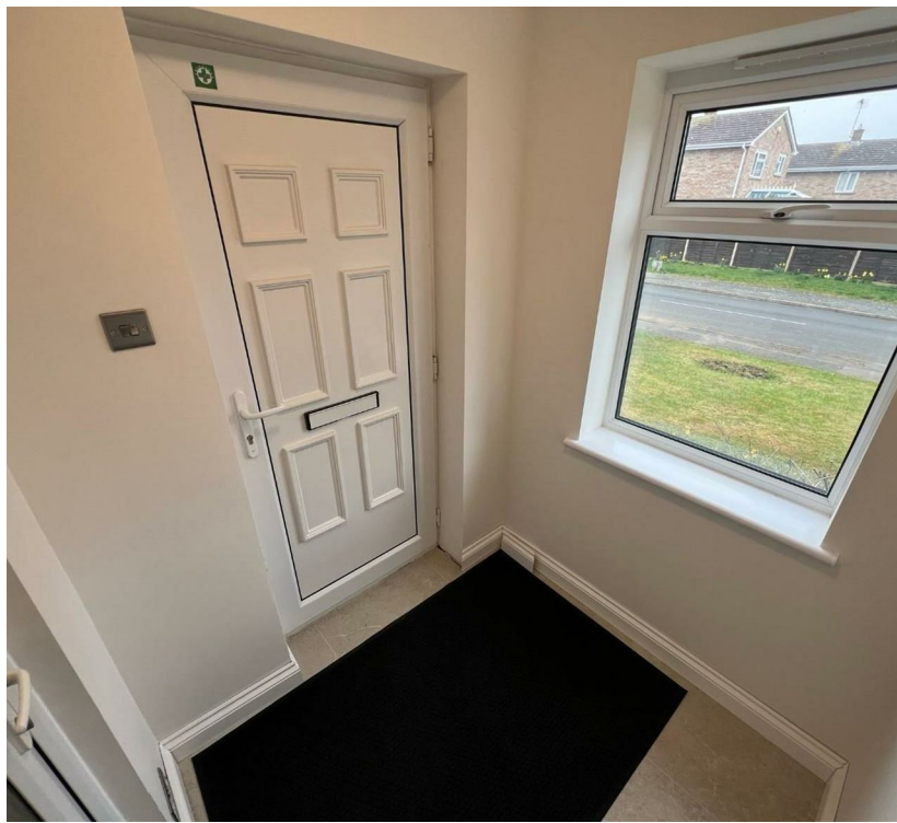
21 Charles Cope Road Orton Waterville PE2 5ER