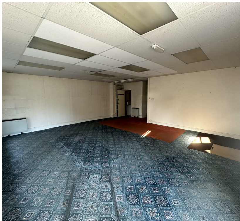
14 East Street PE6 0EN