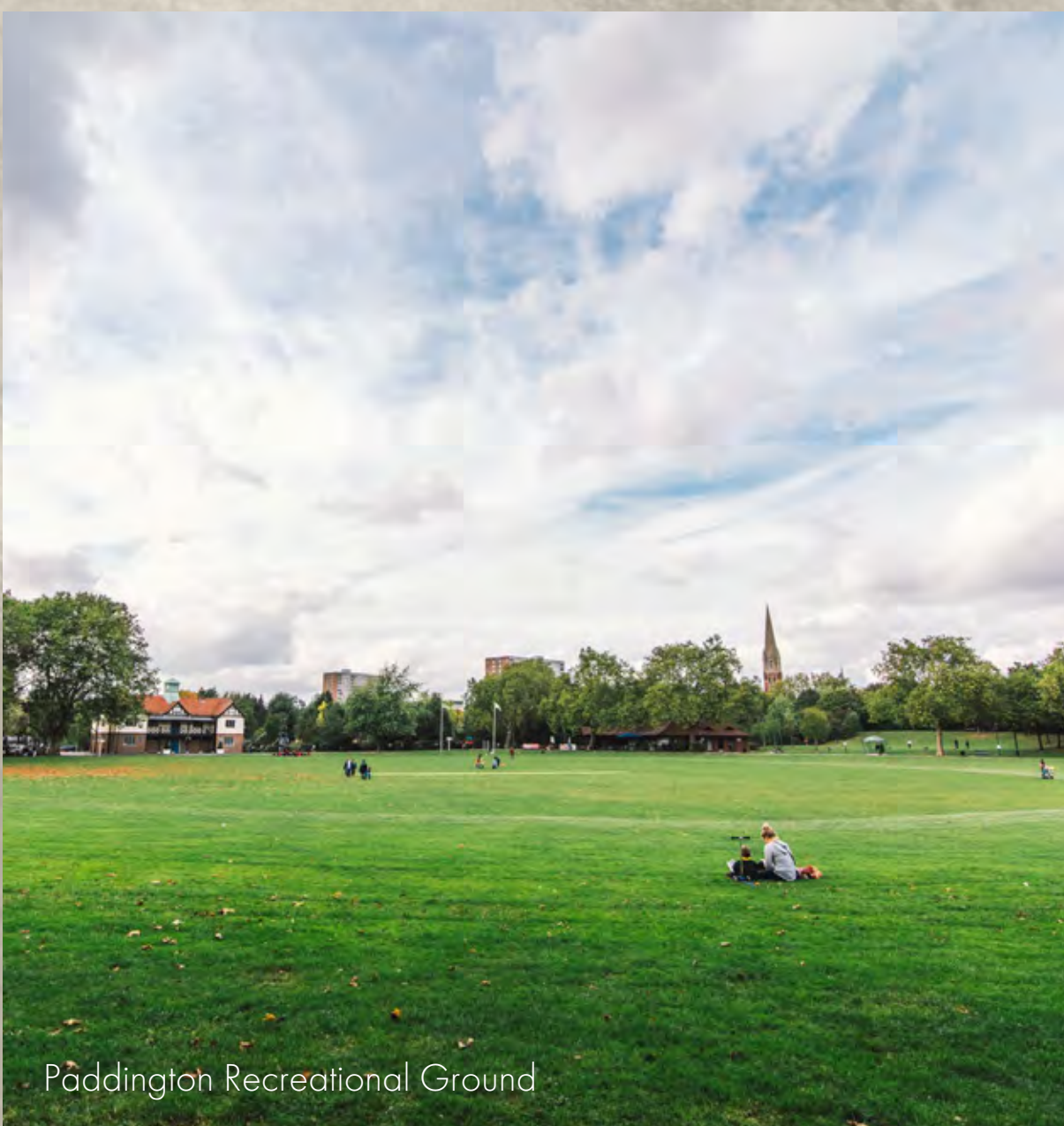
Paddington Recreational Ground