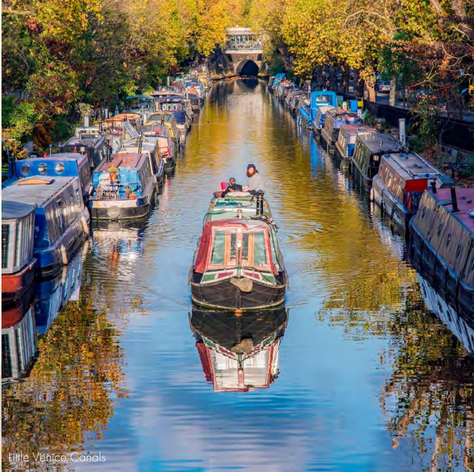
Little Venice Canals

The area is home to a variety of popular cafés and restaurants, including The Waterway and Cafe Laville, offering stunning canal views, as well as neighbourhood favourites like The Elgin and Banana Tree. These destinations provide excellent options for dining, meetings, or casual breaks.