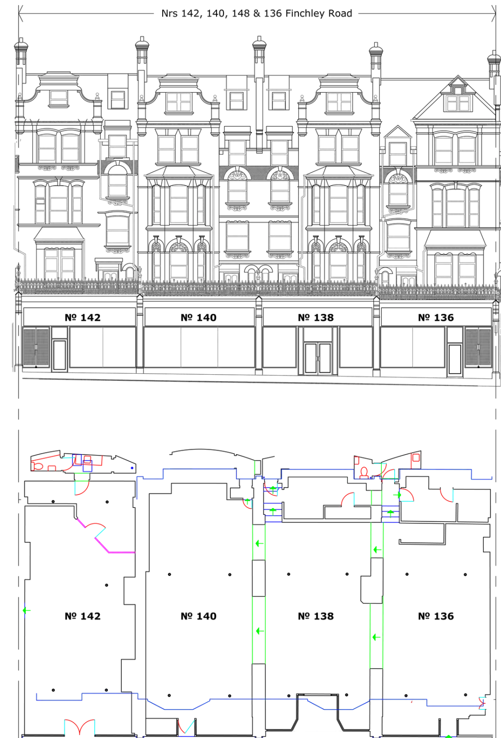
Not to scale.