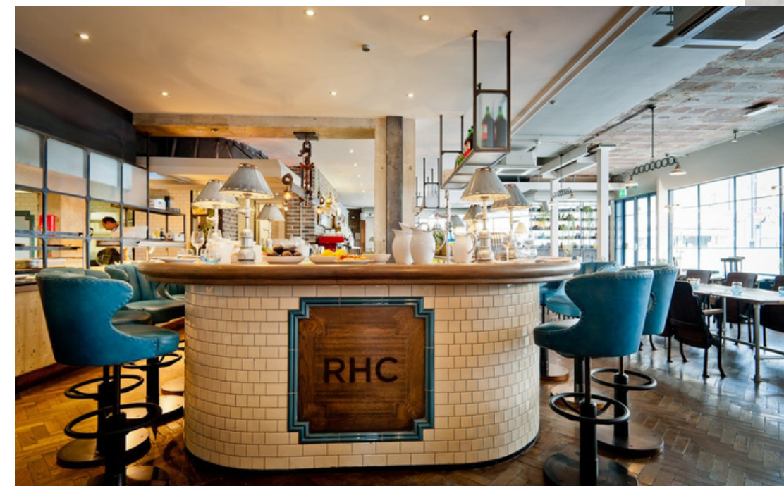
The Riding House Cafe