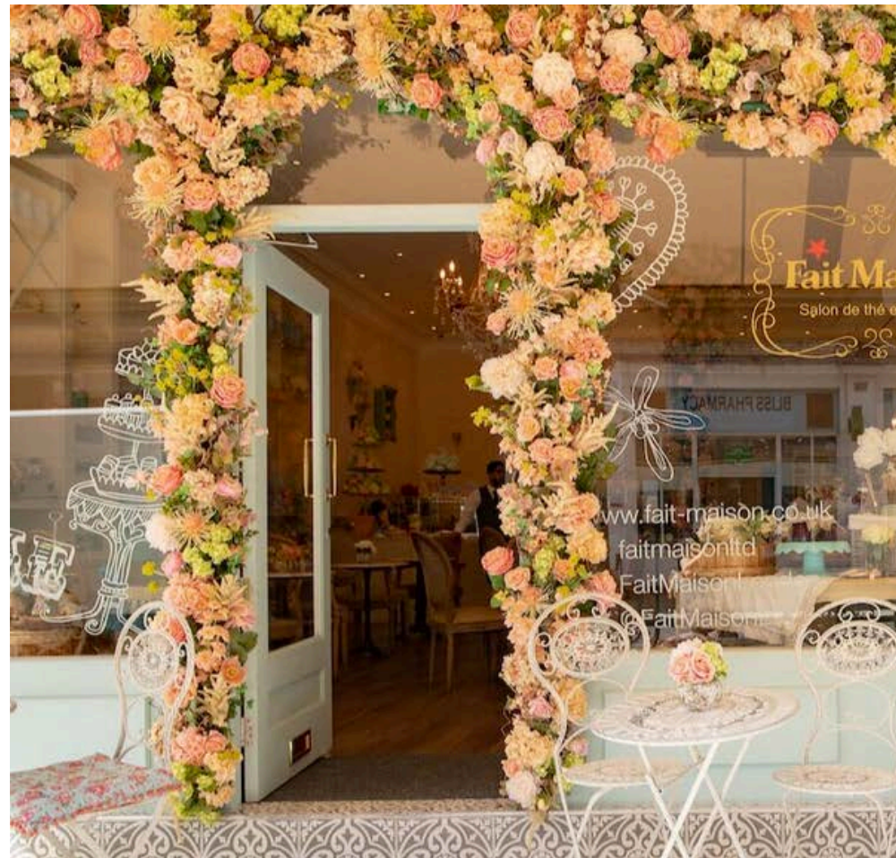
Fait Maison Salon de Thé