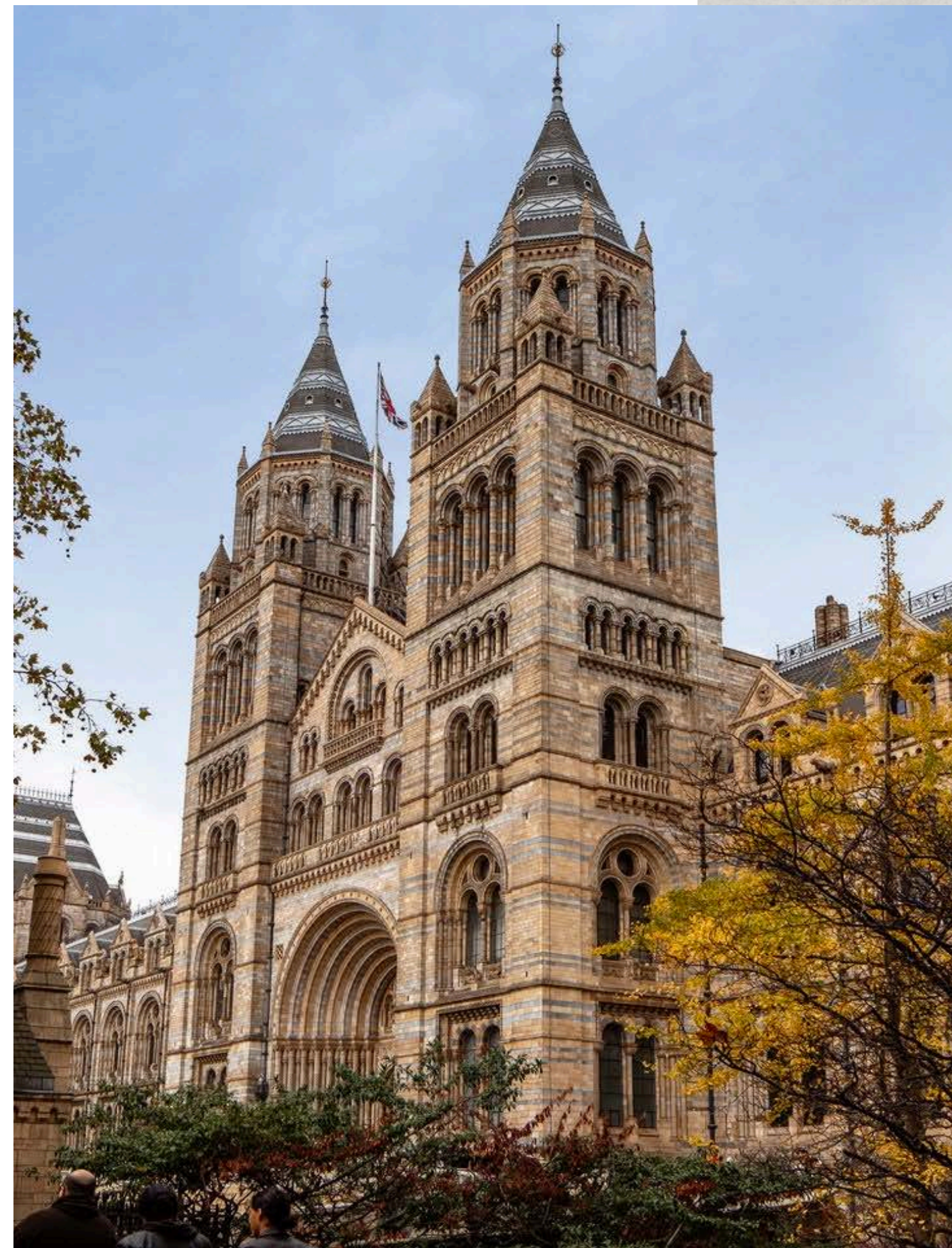
Natural History Museum