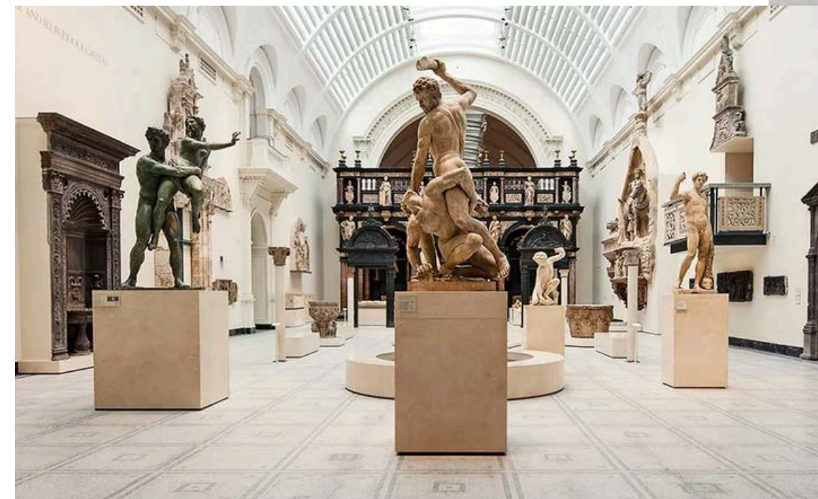
Victoria and Albert Museum