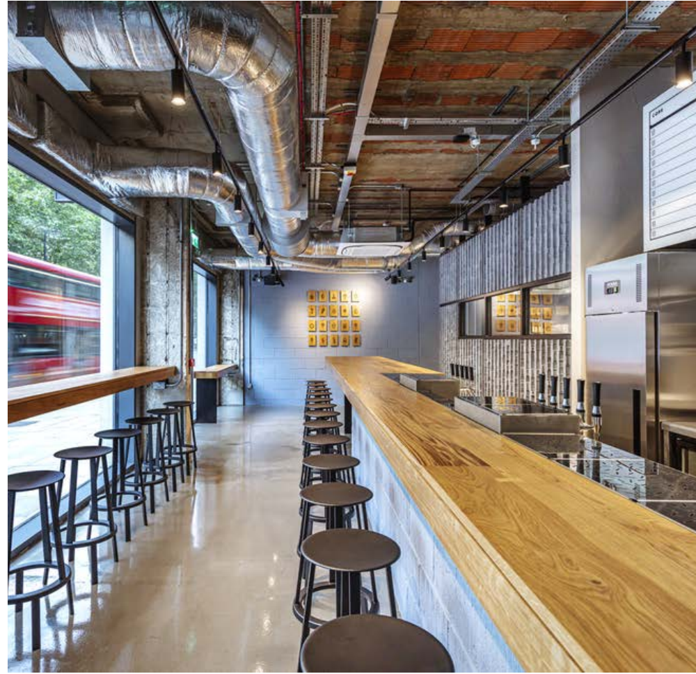
Tayēr + Elementary