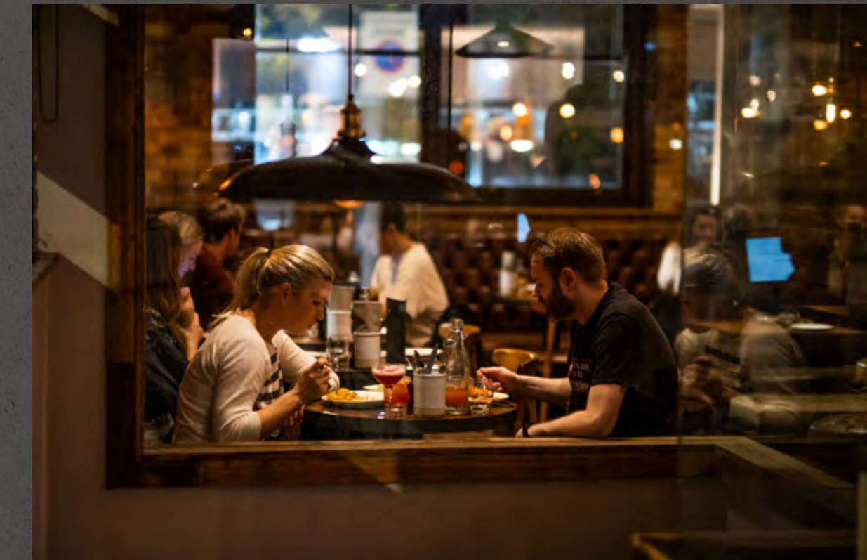
Flour & Grape