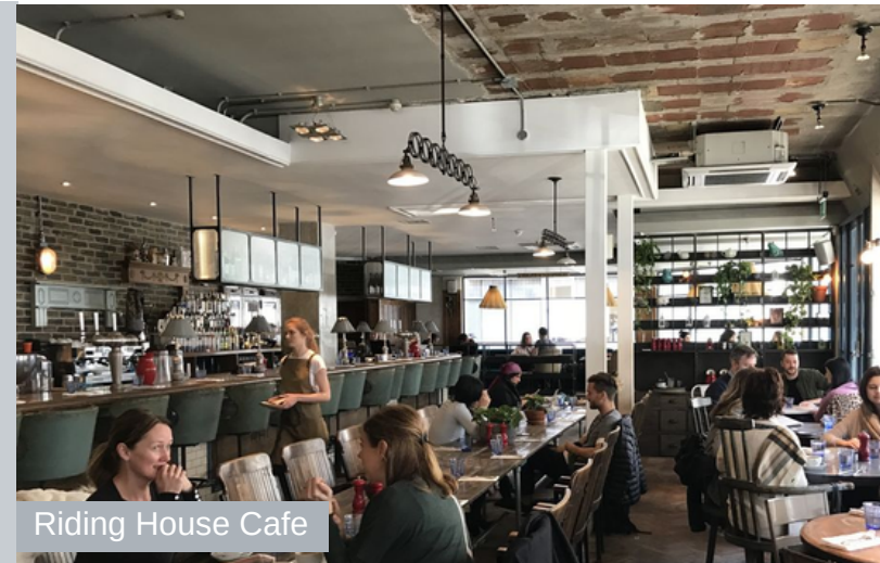
Riding House Cafe

The property benefits from excellent connections with Oxford Circus (0.3 miles), Goodge Street (0.3 miles) and Tottenham Court Road (0.5 miles) underground stations all being in close proximity.