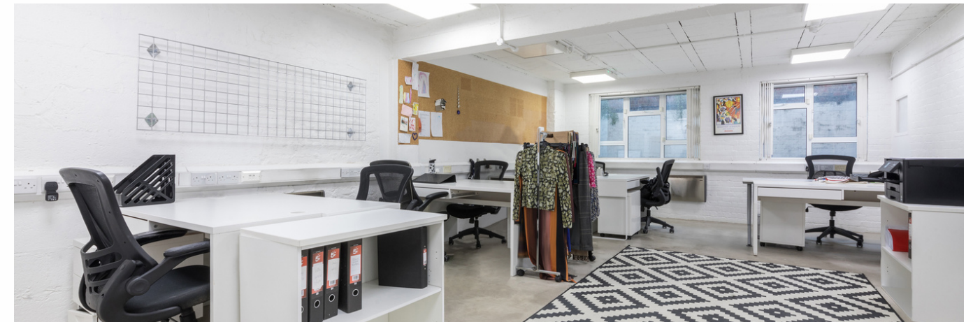
Hampstead Lodge, 77-81 Bell Street