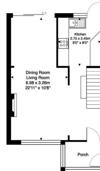
Ground Floor Floor Area: 39.1 m 2 ... 421 ft 2