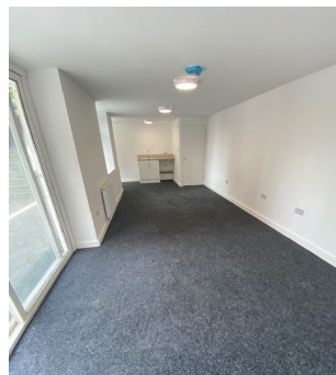
OFFICE 3 – 25 SQ.M