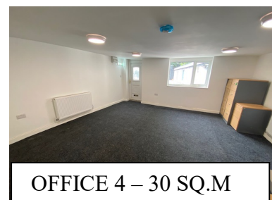
OFFICE 4 – 30 SQ.M