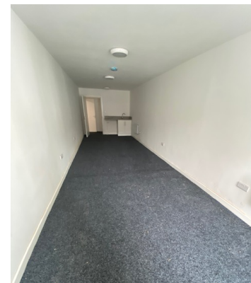
OFFICE 10 – 27 SQ.M