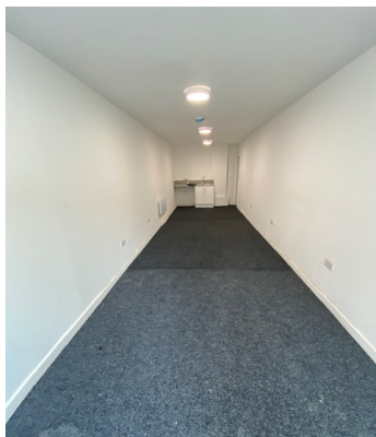
OFFICE 9 – 25 SQ.M