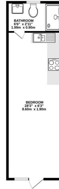
TOTAL FLOOR AREA: 213sq ft. (19.8 sq.m.) approx. Whilst every attempt has been made to ensure the accuracy of the floorplan contained here, measurements of areas, windows, rooms and any other items are approximate and no responsibility is taken for any omission or mis-statement. This plan is for illustrative purposes only and should be used as such by any prospective purchaser. The services, systems and appliances shown have not been tested and no guarantee is given as to their condition or efficiency can be given. Made with Miroplan CAD.