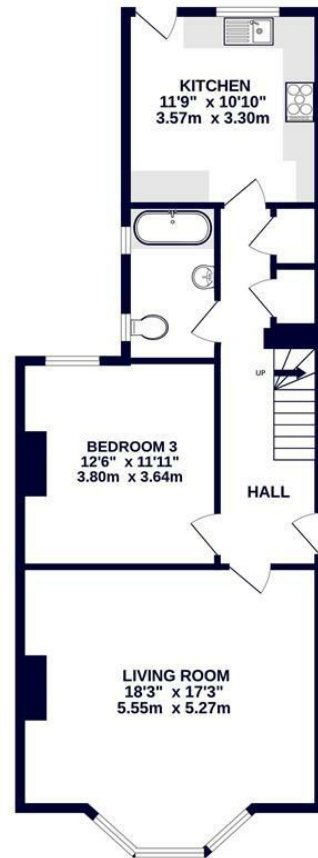
GROUND FLOOR 742 sq.ft. (68.9 sq.m.) approx.