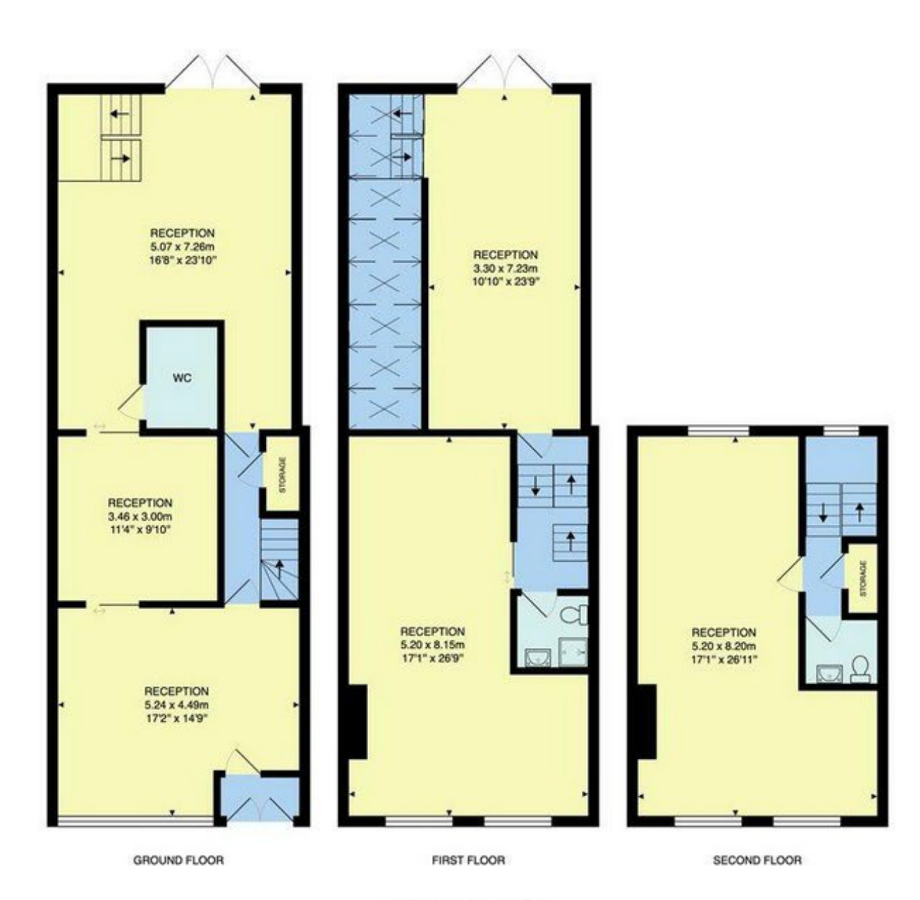
Total Area: 202.9 m² ... 2184 ft<sup>2</sup>

Whitst every attempt has been made to ensure the accuracy of the floor plan contained here, measurements of doors, windows, rooms and any other items are approximate and no responsibility is taken for any error, omission, or mis-statement. This plan is for illustrative purposes only and should be used as such by any prospective purchaser. The services, systems and appliances shown have not been tested and no guarantee as to their operability or efficiency can be given.