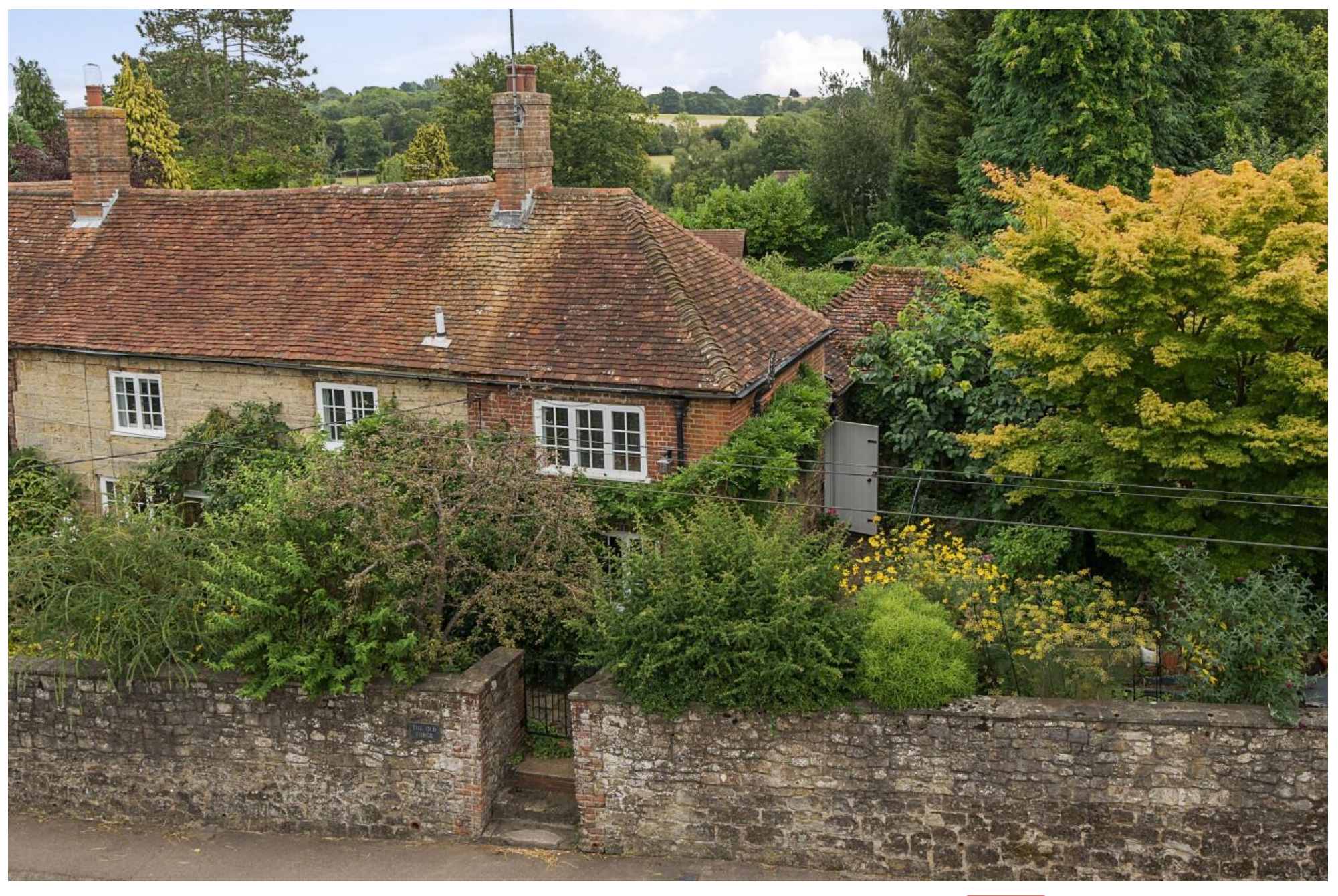
Price Range £700,000 - £750,000 Stane Street, Codmore Hill, Pulborough, West Sussex