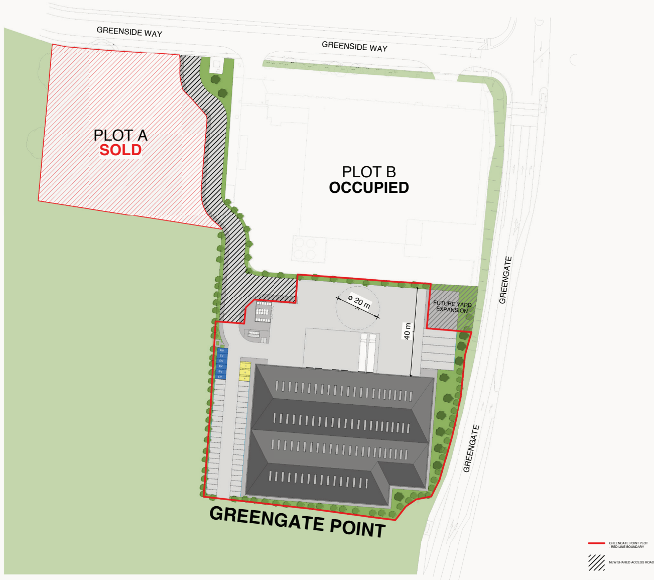
GREENGATE POINT - RED LINE BOUNDARY PLAN 1:500