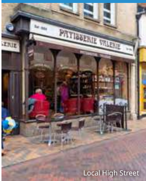
Local High Street