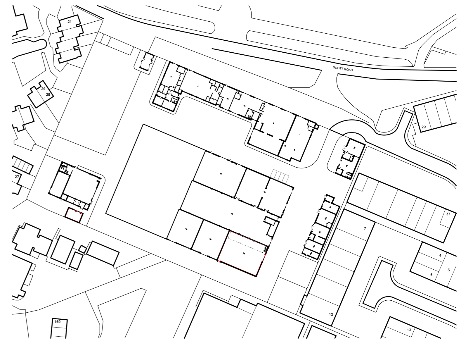
0m 10m 20m 30m 40m 50m K.A.D. Licensed O.S. No. 100047482 LOCATION PLAN @ 1:1250