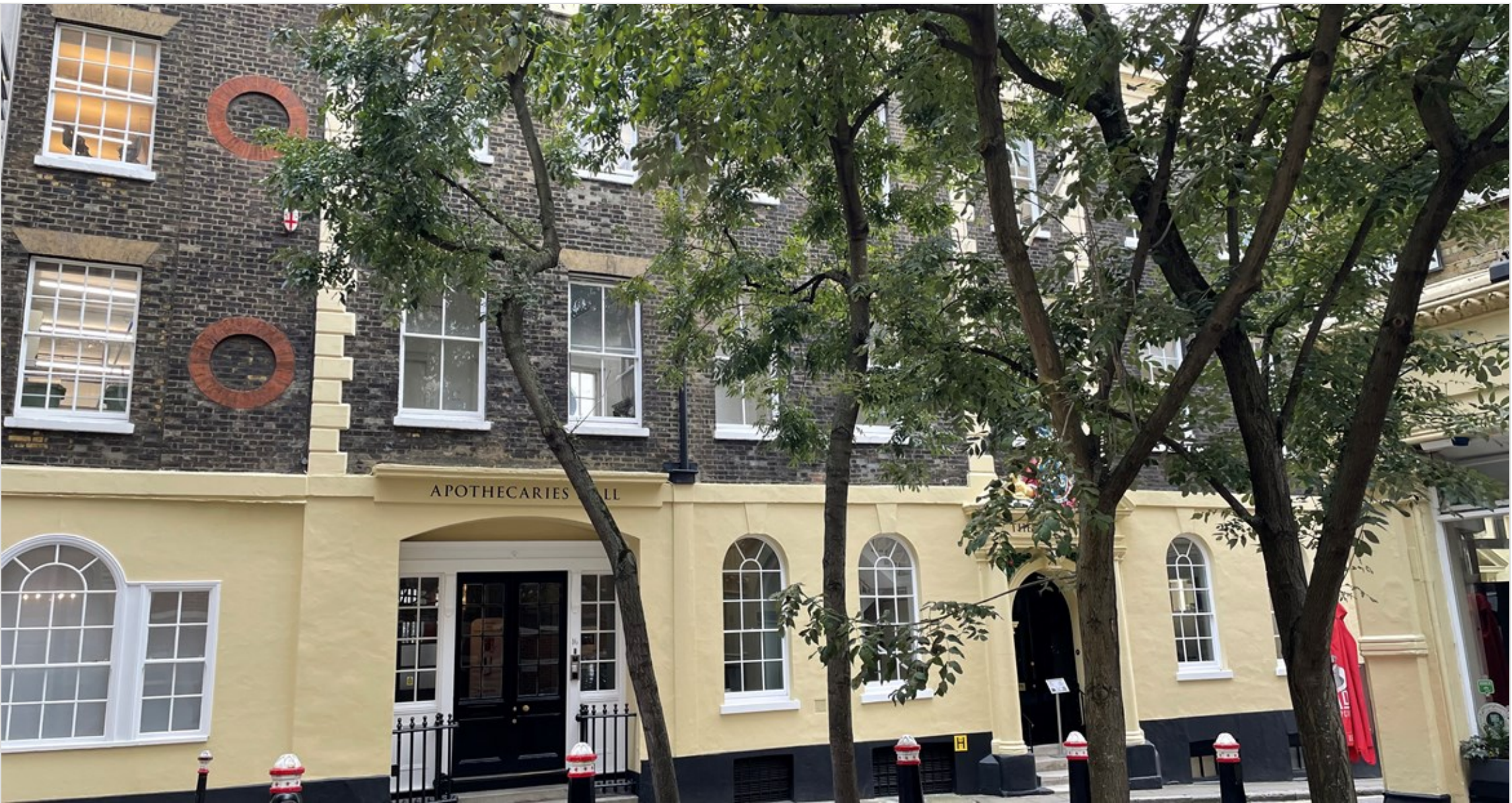
The Houses, 16-18 Blackfriars Lane, London, EC4V 6EB