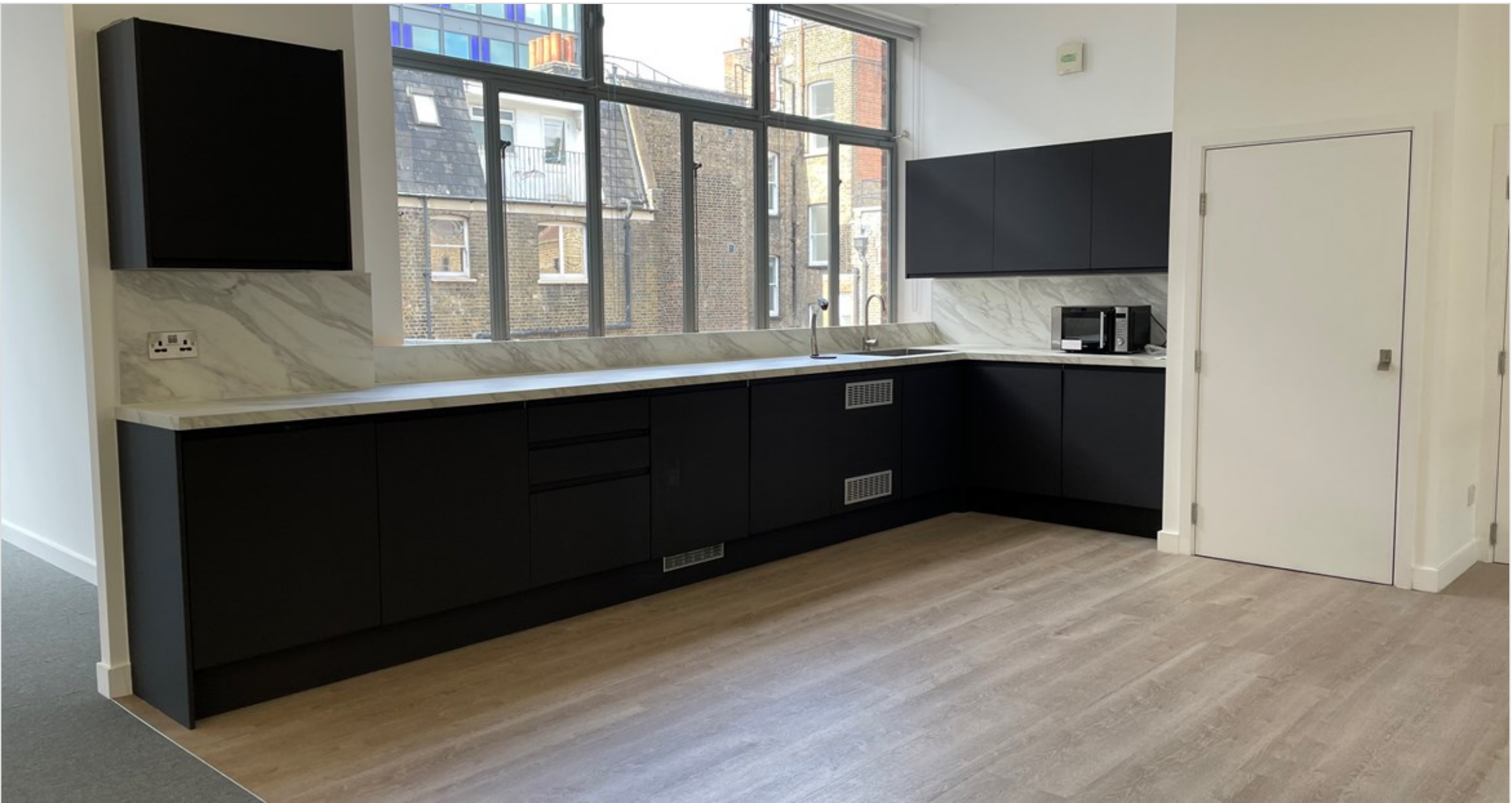
High Holborn House, 52-54 High Holborn, London, WC1V 6RL