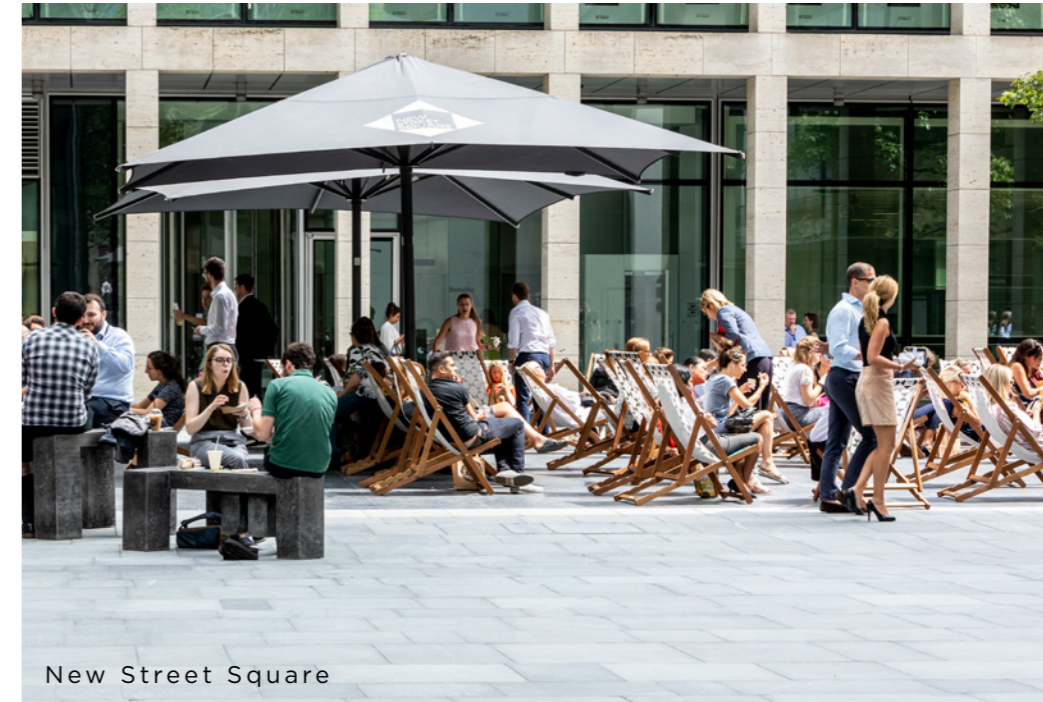
New Street Square