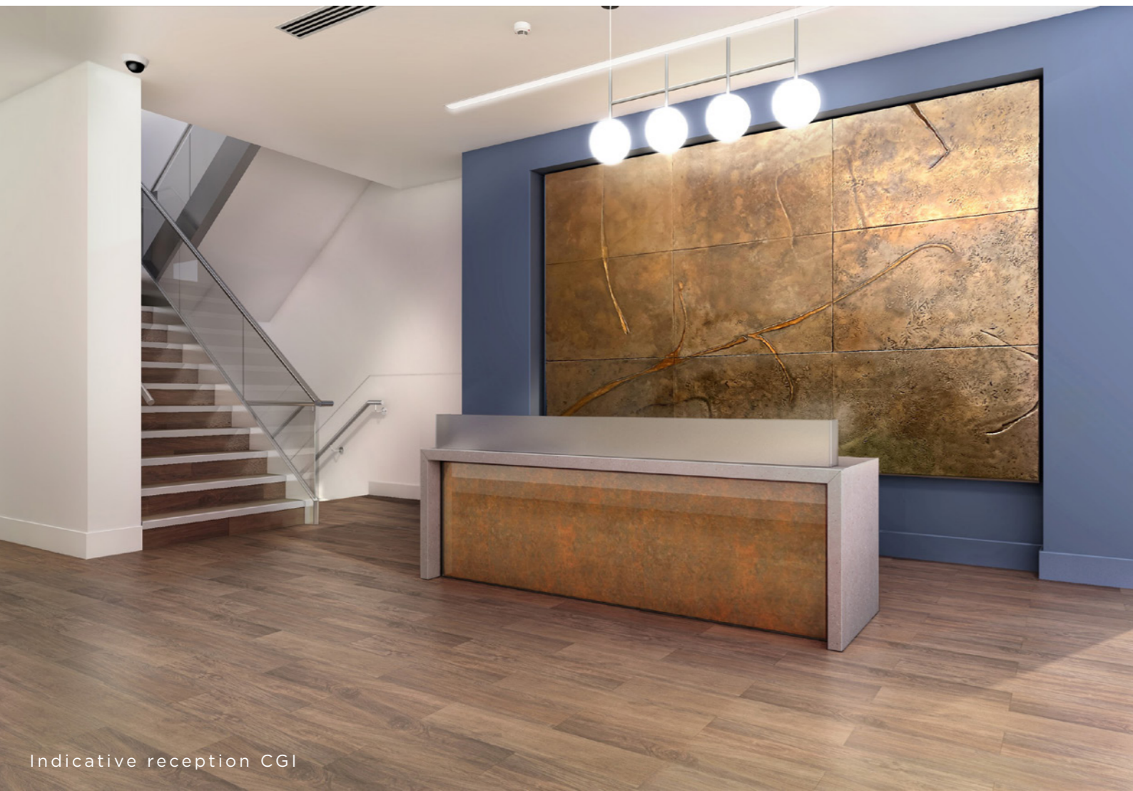
Indicative reception CGI

The building reception has also been comprehensively refurbished to provide a high quality arrival experience - and is manned throughout the day.