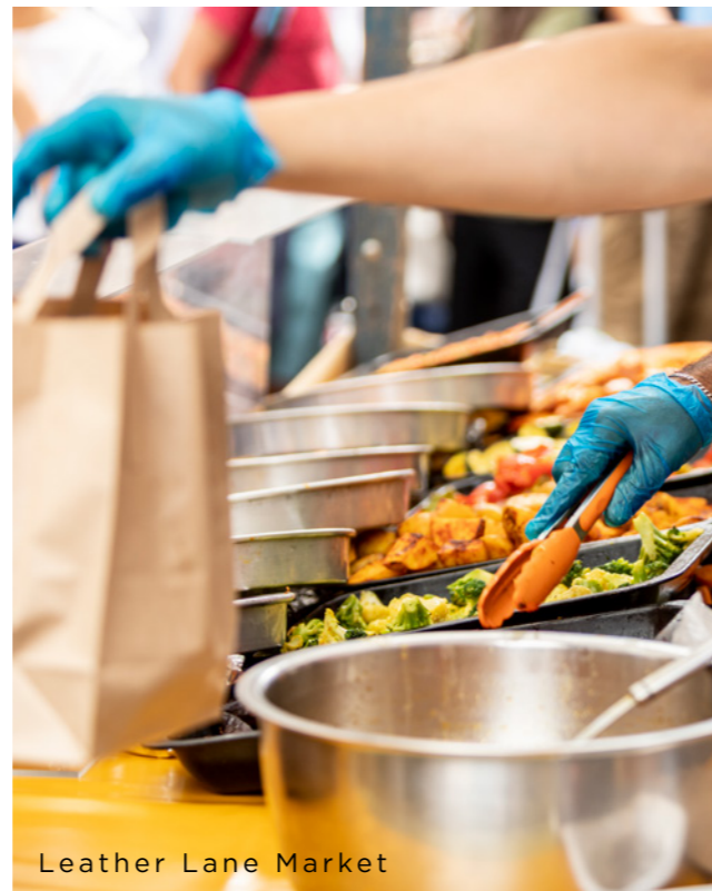
Leather Lane Market