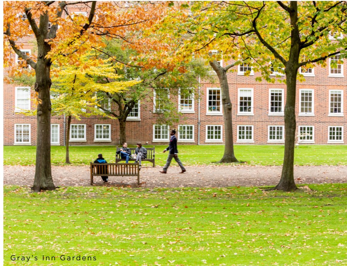
Gray's Inn Gardens

It is well connected to both the City and West End with superb transport links including Underground, National Rail and Crossrail stations all moments away.