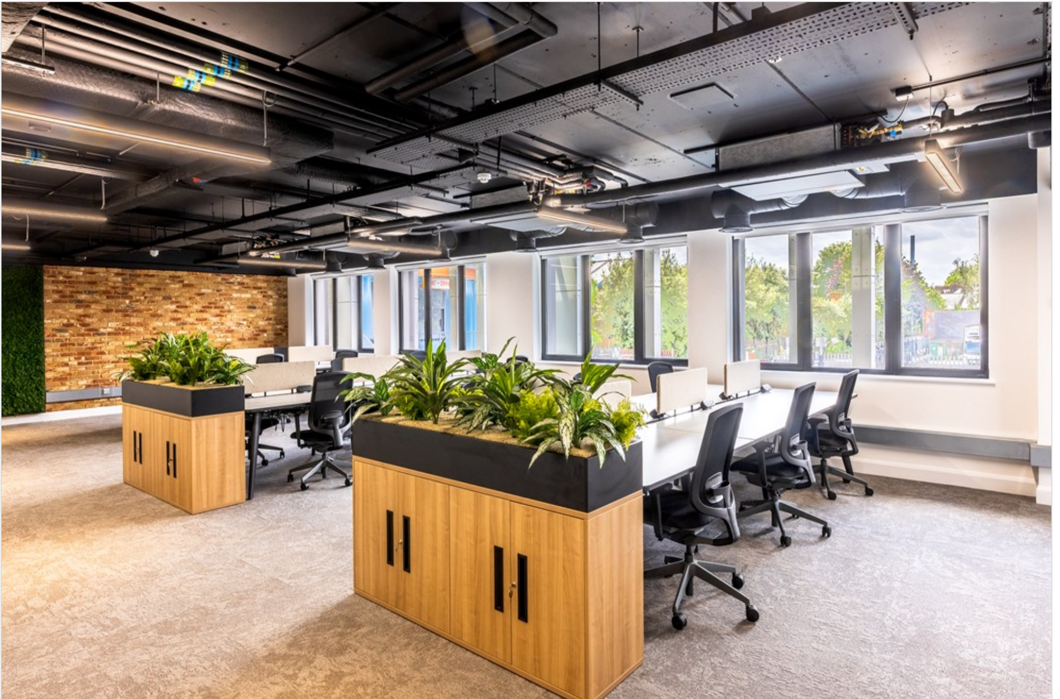
Battersea Studios, 82 Silverthorne Road, London, SW8 3HE