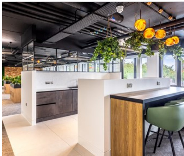
Battersea Studios, 82 Silverthorne Road, London, SW8 3HE