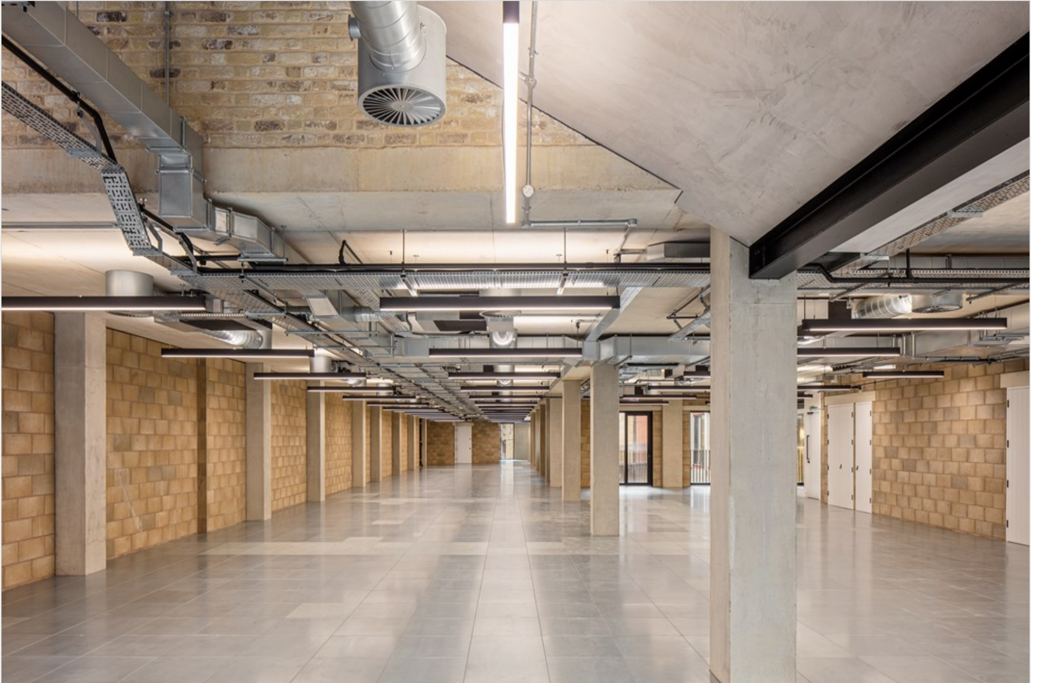
Great Suffolk Yard, 127 - 131 Great Suffolk Street, London, SE1 1PP