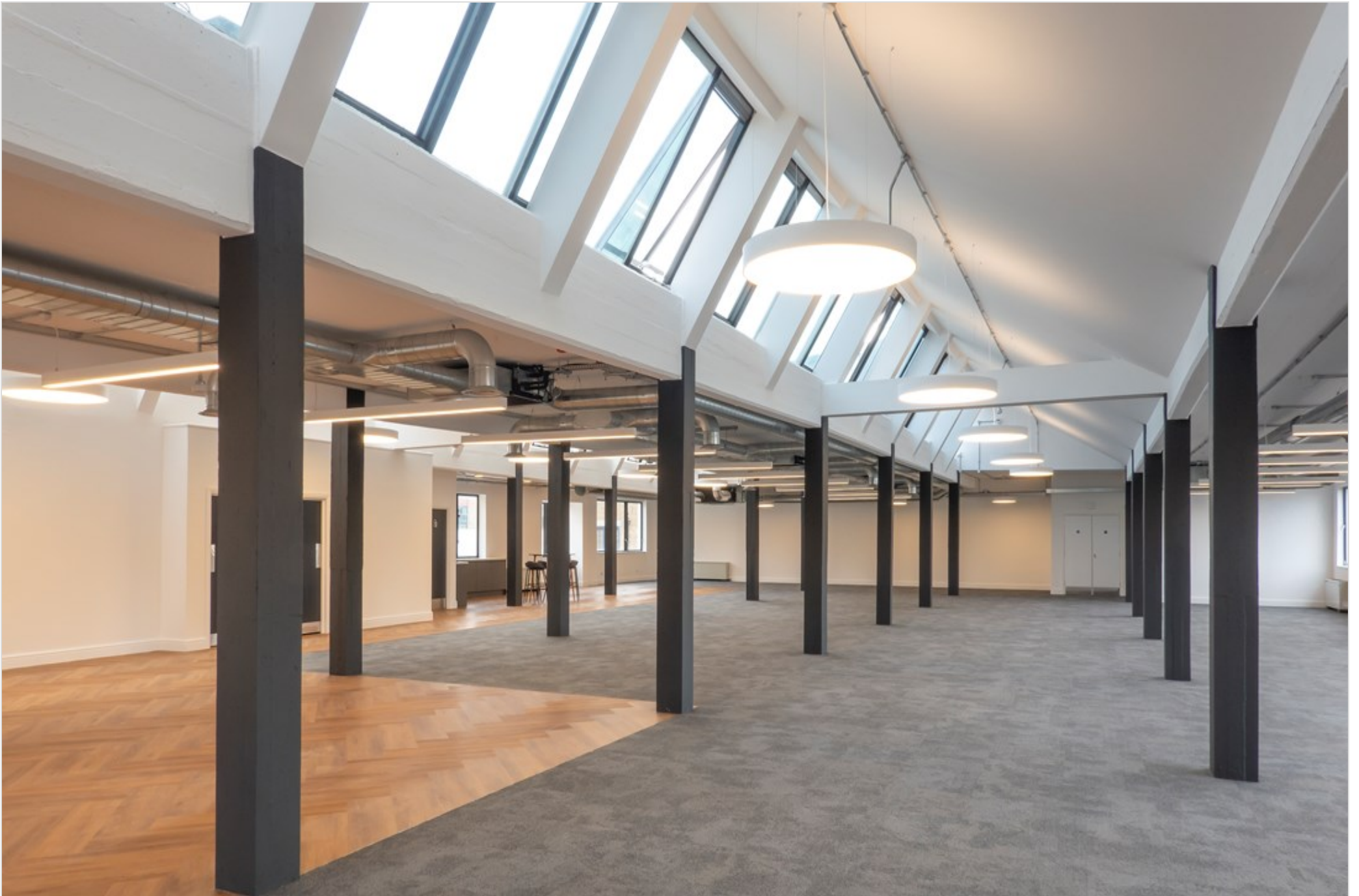
India House, 45 Curlew Street, London, SE1 2ND