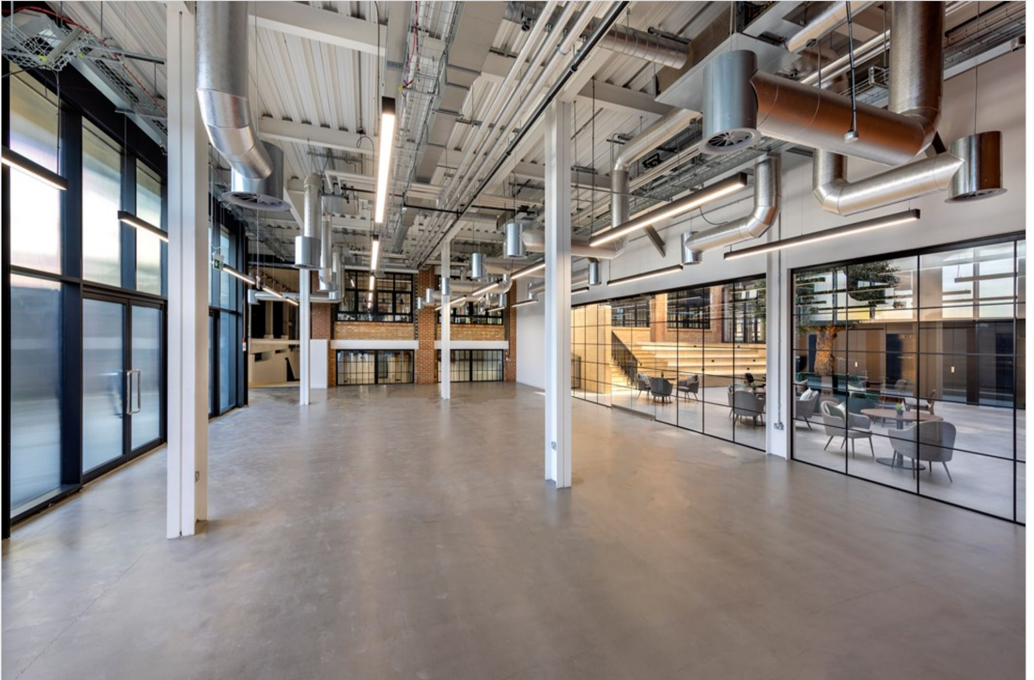
The Pickle Factory, Crimscott Street, London, SE1 3BH