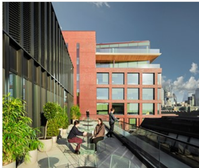
MYO Bankside, 133 Park Street, London, SE1 9EA