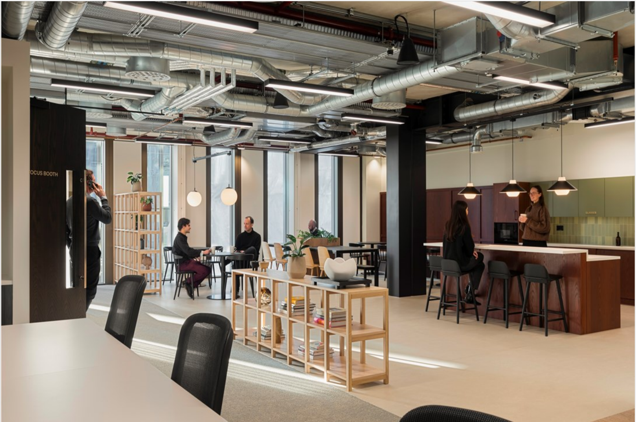
MYO Bankside, 133 Park Street, London, SE1 9EA