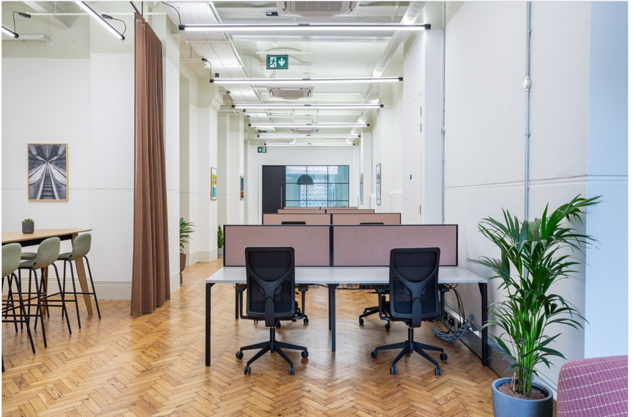
9 Marshalsea Road, London, SE1 1EP