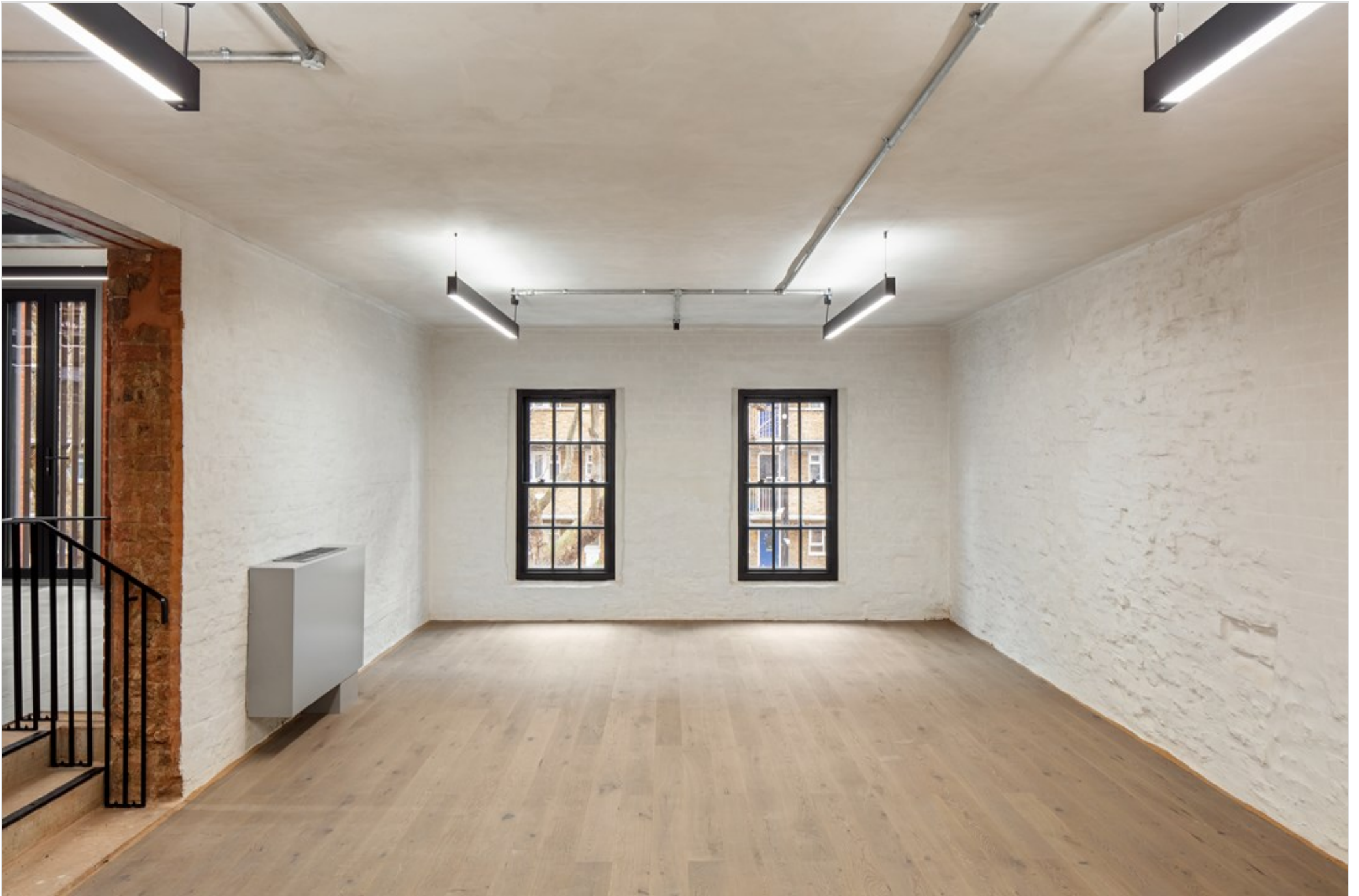
Great Suffolk Yard, 127 - 131 Great Suffolk Street, London, SE1 1PP