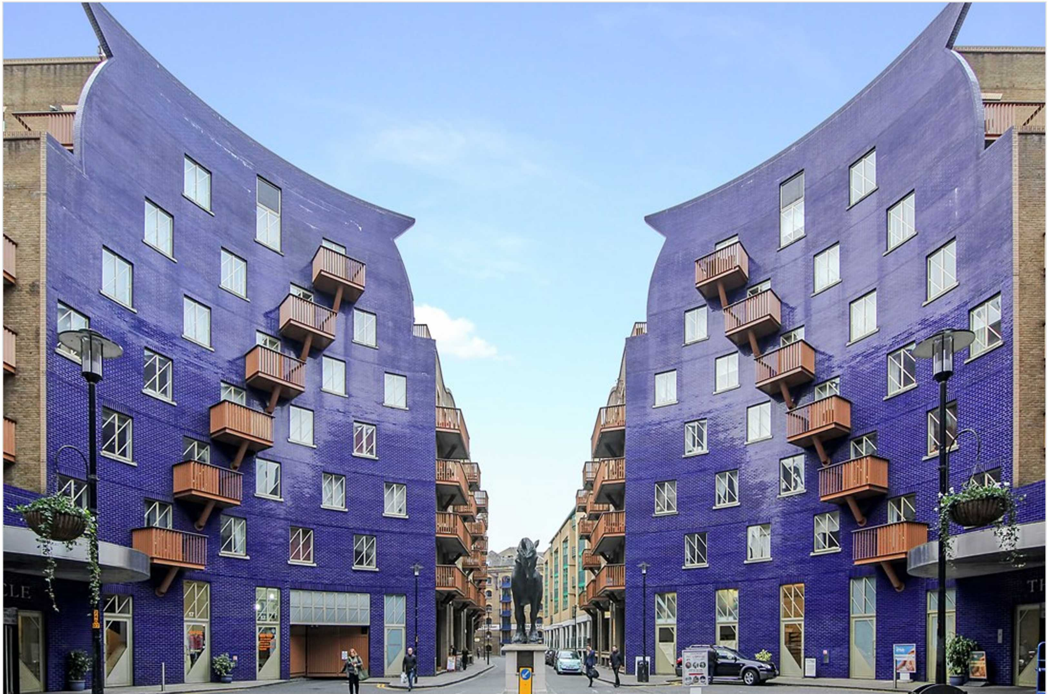
20A The Circle, Queen Elizabeth Street, London, SE1 2JE