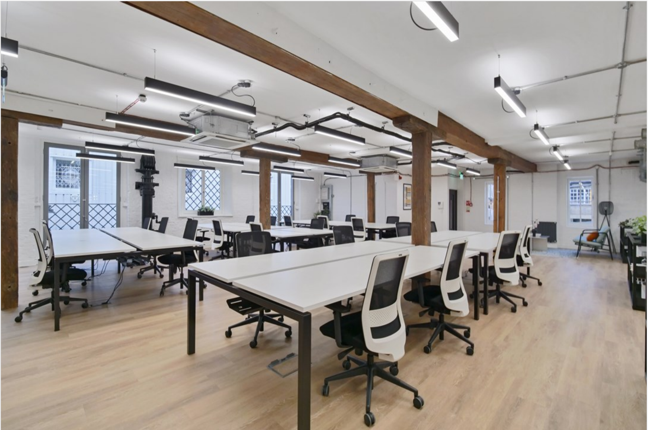
56 Ayres Street, London, SE1 1EU