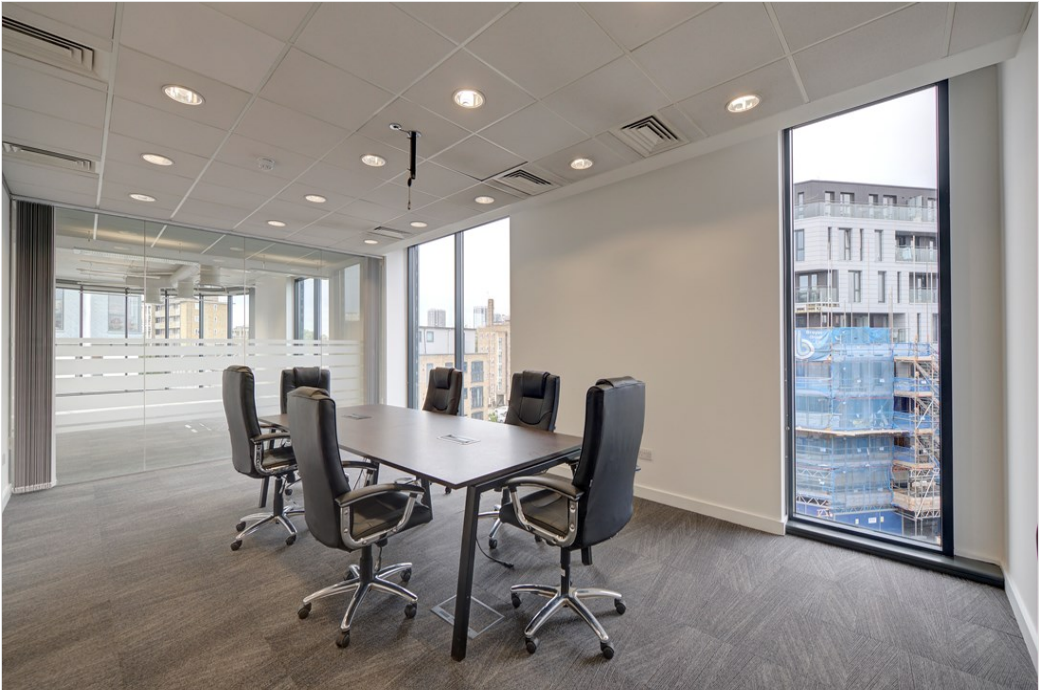
93 Great Suffolk Street, London, SE1 OBX