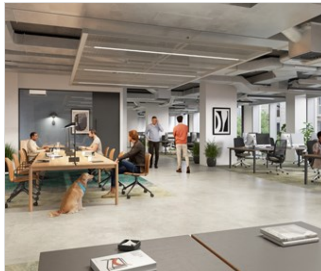
Phoenix Works, Oval Village, London, SE11 5QU