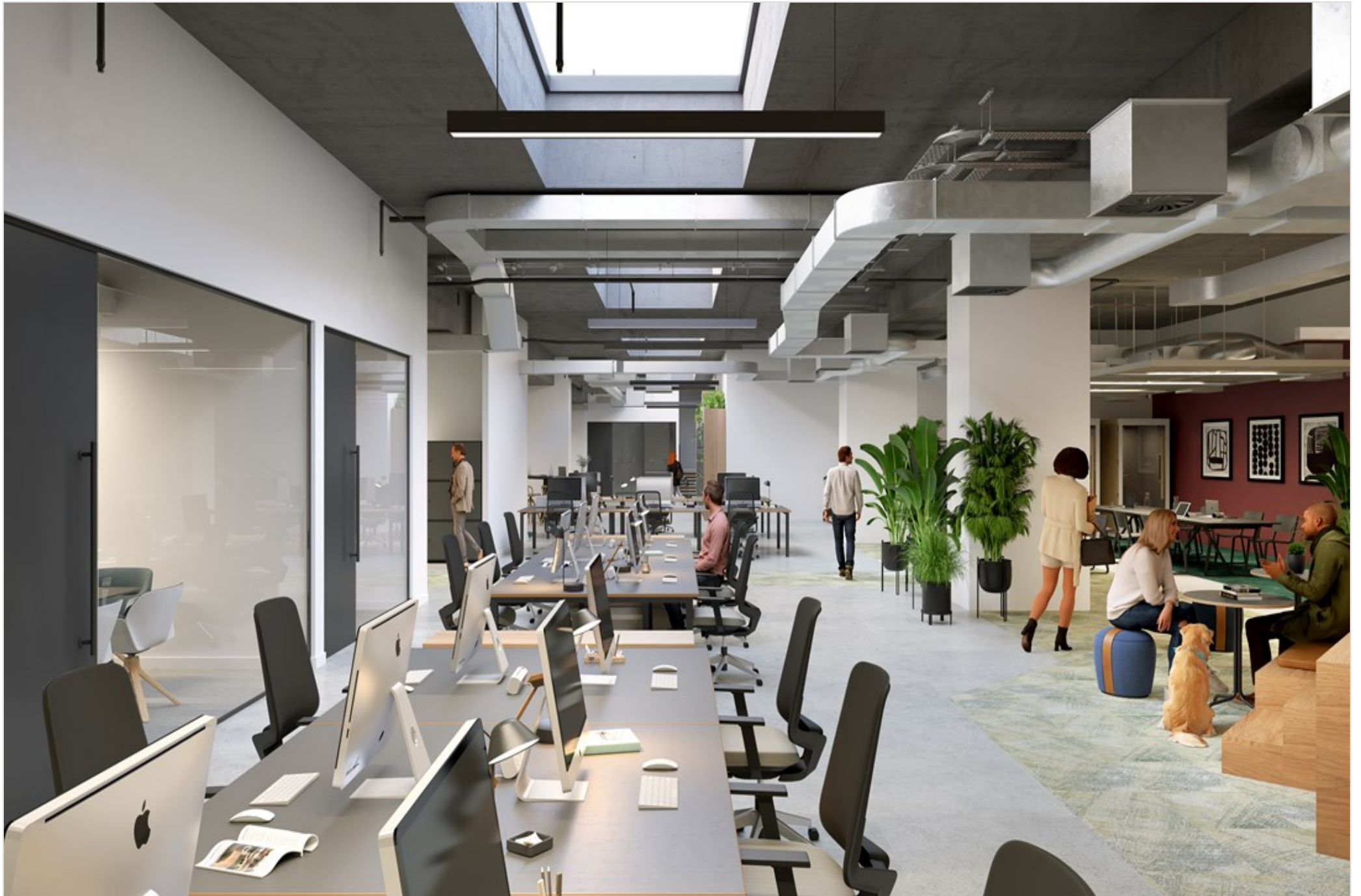
Phoenix Works, Oval Village, London, SE11 5QU