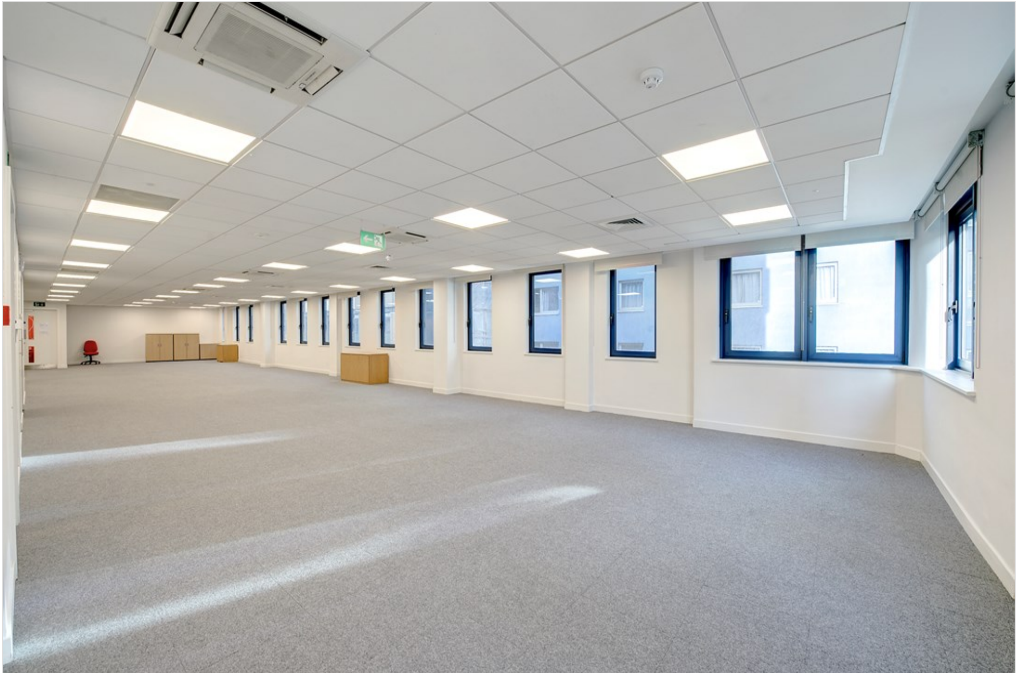
116-118 Walworth Road, London, SE17 1JJ