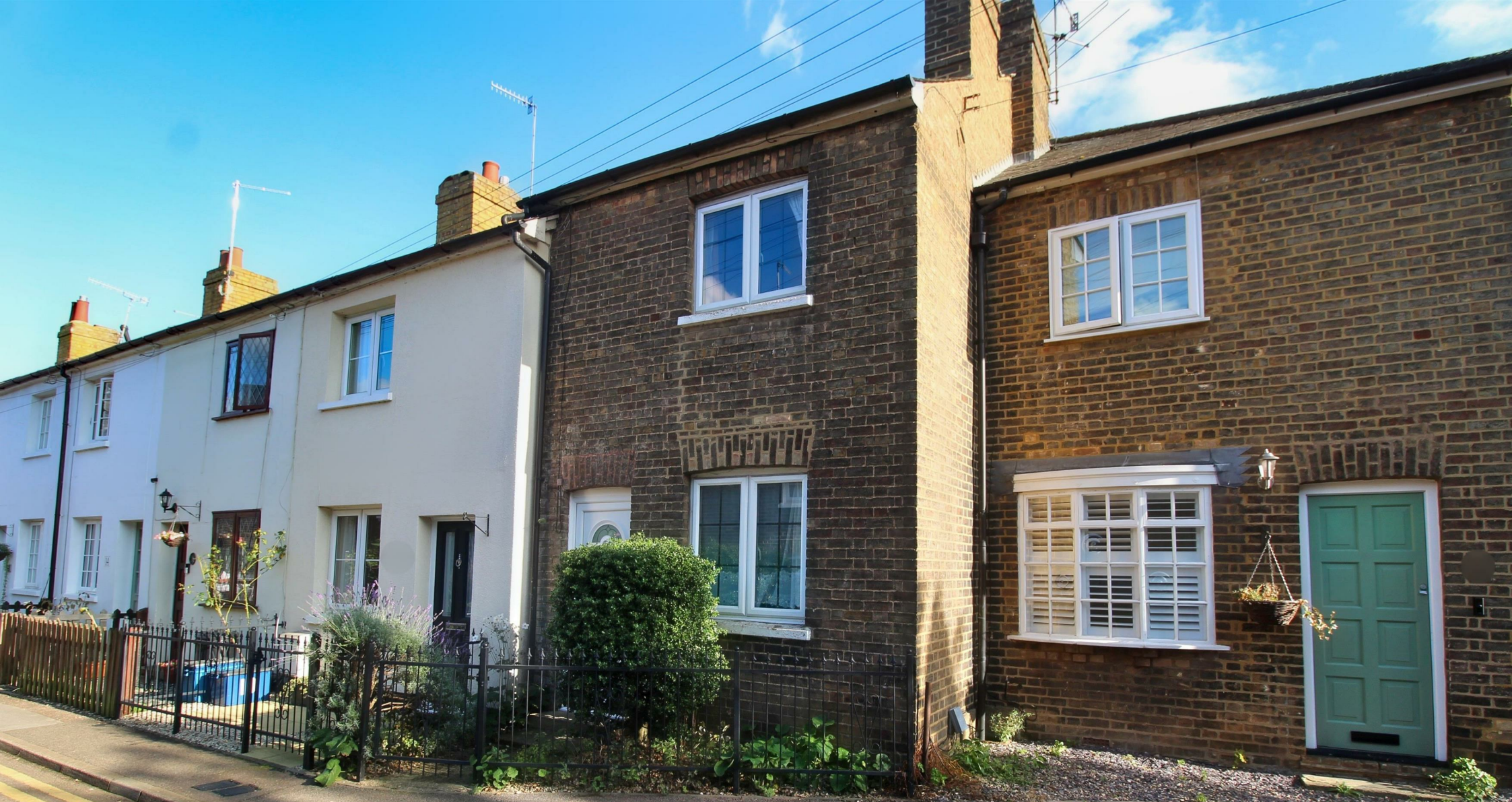
The Folly, SG14 1QD Hertford