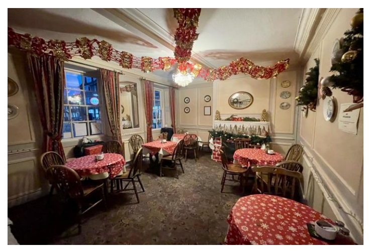
GUIDE PRICE £265,000 GODS PROVIDENCE, ST. THOMAS' SQUARE, NEWPORT, PO30 1SL