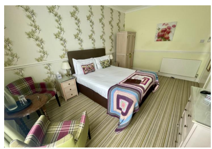
GUIDE PRICE £950,000 THE CLIFTON, 1 QUEENS ROAD, SHANKLIN, PO37 6AN