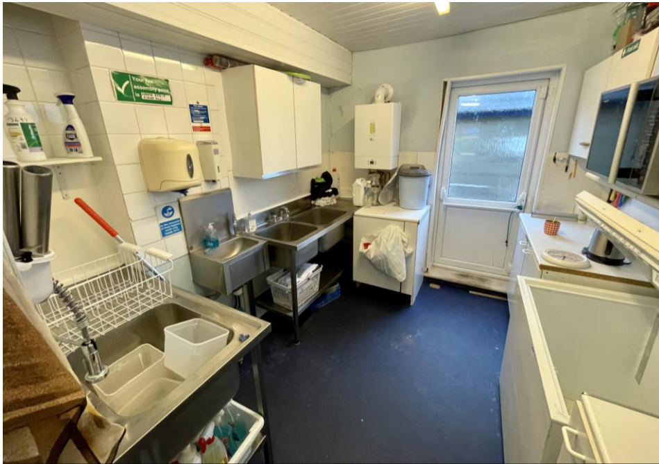
Ground Floor Retail